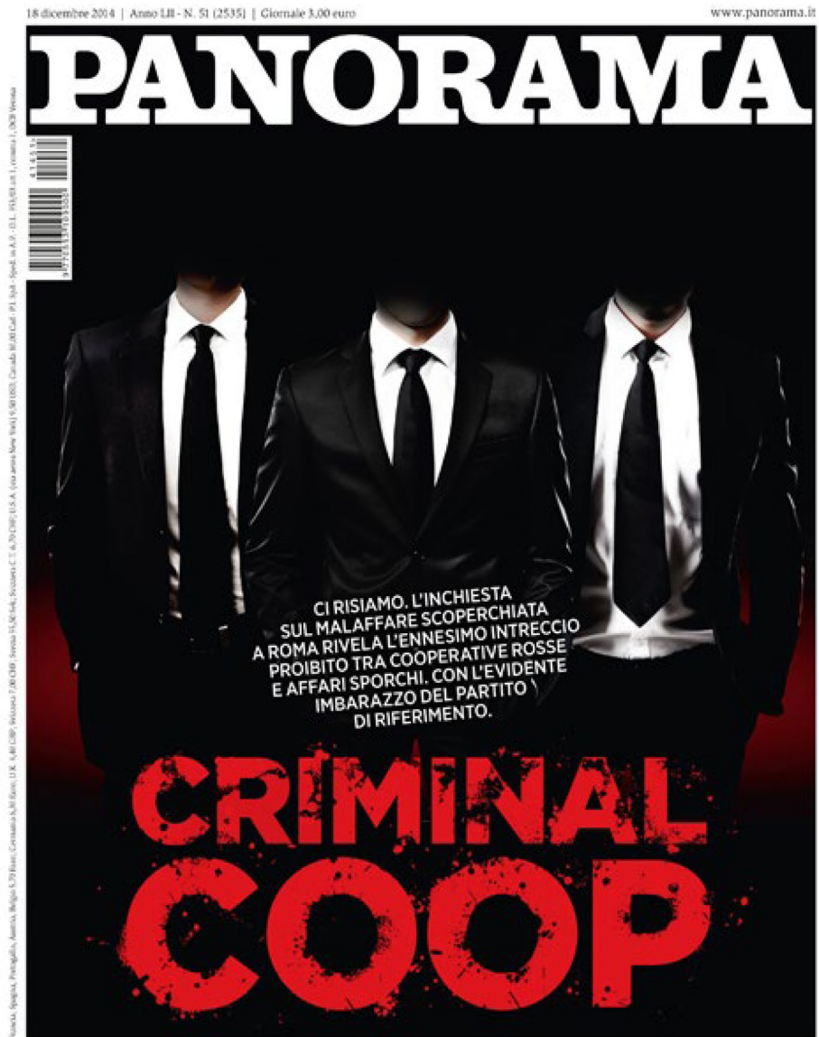
Fig. 2 Example of the stigma tainting cooperatives, Translation of the text in the image: “Criminal cooperatives. Here we go again. The investigation into corruption in Rome unveils the illicit connections between cooperatives and illegality, causing embarrassment for their affiliated political party.” (Our translation)

authors and subsequently reviewed by a native English copy editor to ensure accuracy, clarity, and fidelity to the original meaning.