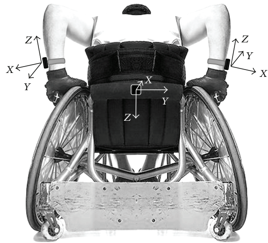
FIGURE 1: Wheelchair- and wrist-mounted IMUs with the relevant systems of reference.

Each athlete performed a 20-metre sprint test (20 mS). This test, focusing in particular on start-up and steady state velocities, was selected within those proposed for adult wheelchair basketball players [23] and then validated in terms of reliability for junior athletes [24]. It includes crucial factors in wheelchair basketball performance, such as starting and sprinting, which involve both strength capacity and coordination skills [23, 25]. Athletes started from a static position with the front wheels behind the start line and, after the start signal, pushed themselves for 20 metres as fast as possible. Time was manually recorded using a digital stopwatch ( t_{20\text{mS}} ). The test was performed twice and the