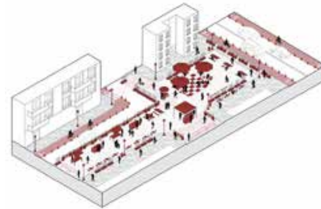
Design simulation: Temporary solution and Long-term solution

The second simulation (temporary solution) presents the first phase of change (Fig. 6), that following the protocols of Tactical Urbanism applies temporary design interventions aimed at qualifying urban public space using limited resources to catalyze long-term change (Lydon & Garcia, 2015). With this approach, the design solution creates an impulse, triggering regenerative processes with little expenditure of energy that can profoundly change and improve the livability of public space and the quality of life of the people who use it daily. Reactivating, through temporary interventions, areas that can thus be returned to the people. This approach uses iterative development processes, efficient use of resources and creative potential generated by social interactions. It allows for the immediate re-appropriation, re-design, re-planning, and re-use of public spaces (Lydon & Garcia, 2015). In the simulation, the temporary interventions apply the recommendations: a) closing of the street and the painting of ground with colorful patterns (Referring to R. 1); b) inserting temporary urban furniture, such as stands,