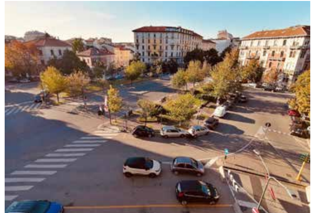
Fig.3 Comune di Milano, 2019

primary school and kindergarten) dedicated to Umberto Eco (Arsuffi, 2019).