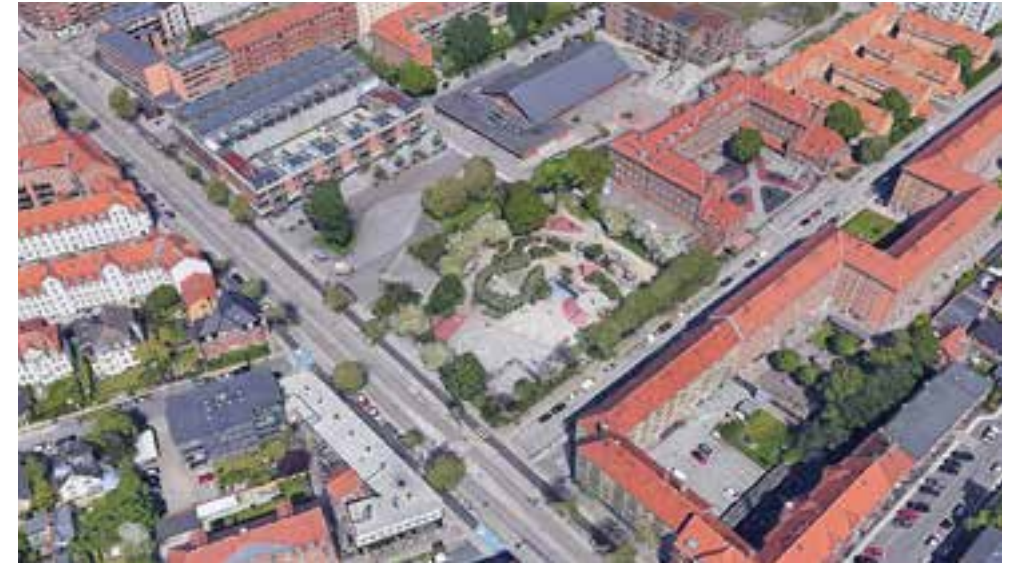
Fig.1 Municipality of Copenhagen, 2020

research focuses on a comparison between height cases for each city.