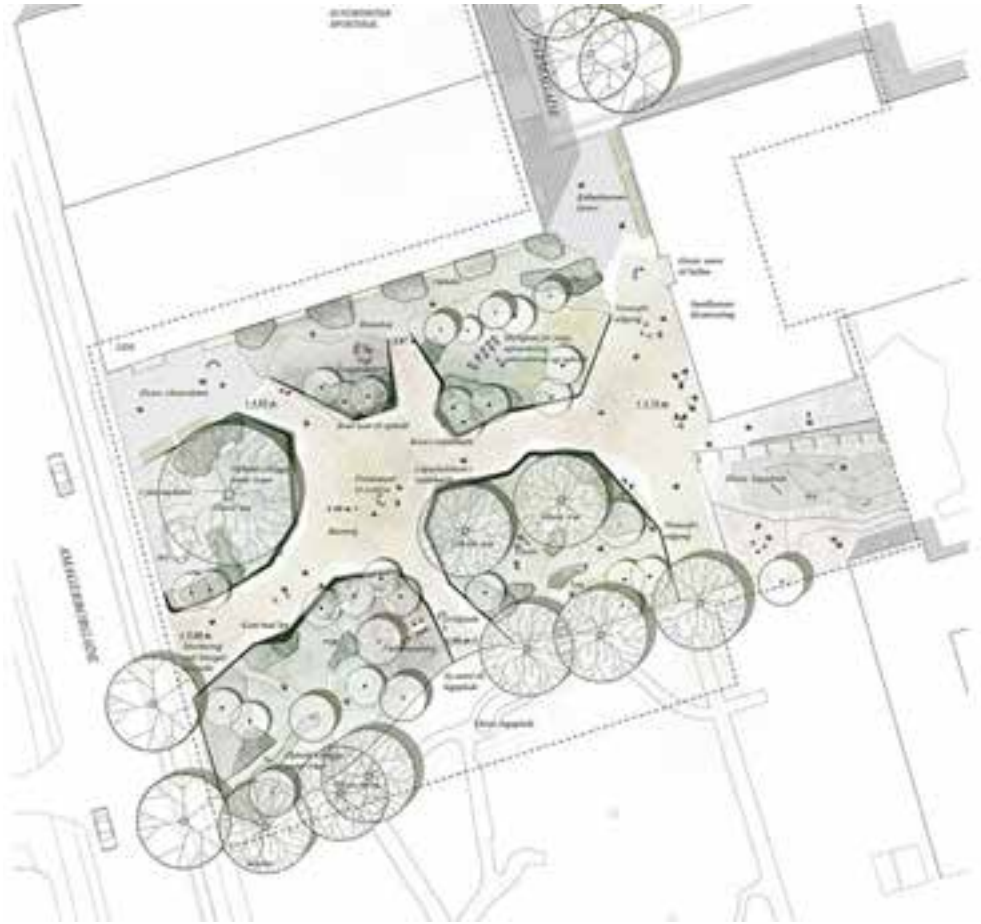
Fig.2 BOGL, 2021

such as teenagers and young adults, who have brought new activities to the square (i.e. physical exercise).