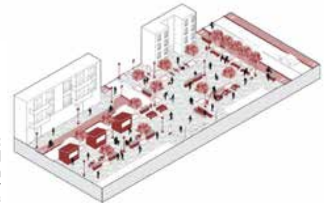
Fig. 7 Caricati & Vettore, 2023

tables, benches, food carts, string lights, umbrellas and so on (R.2); c) influencing the traffic management, adding a new bike lane and zebra crossing for the new pedestrian area (R.3); d) and adding green areas with planters, and flowers, in order to create a better atmosphere, protect from cars and try to improve the air quality (R.4). The third and last scenario shows how these design interventions can become in the long-term perspective (Fig. 7). The result of this square is made possible with the help of the users of the space implementing – together with actions in the material conditions of the space in which they can take part – a process of co-design about the program and the management of the area. Through them, the playful and colorful paving was transformed by opting for a more