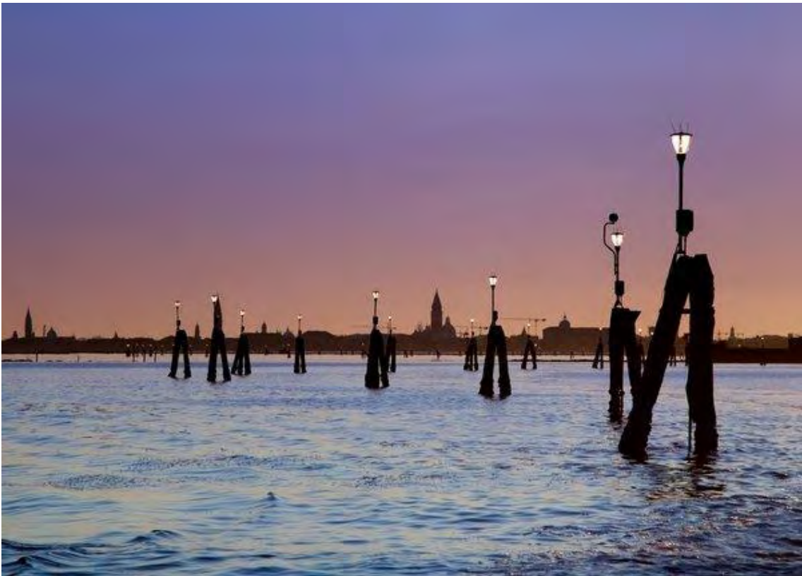
3. Bricole in the Lagoon