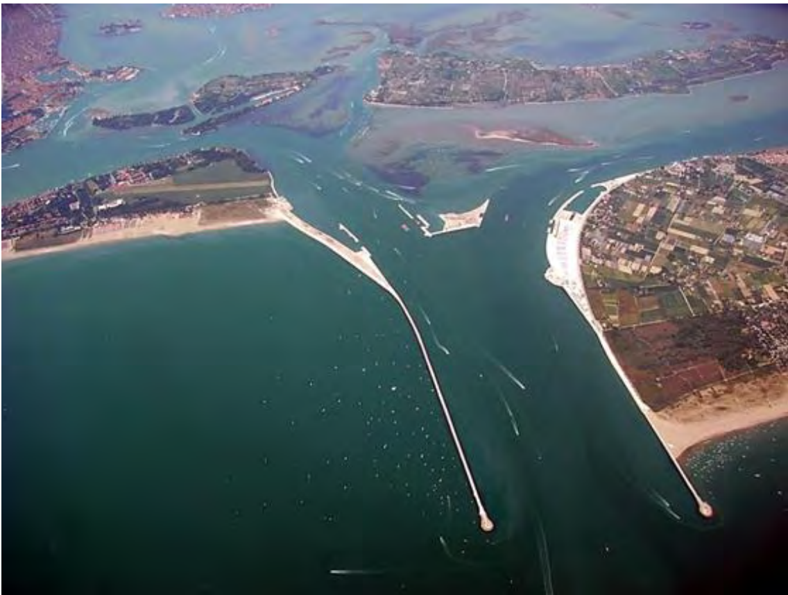
9. The MoSE construction works in the inlet of Lido (between the island of Lido and the locality Punta Sabbioni, in the North of the Venice Lagoon) with the new artificial island