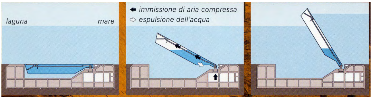
5. Mechanism of operation of MO.S.E.