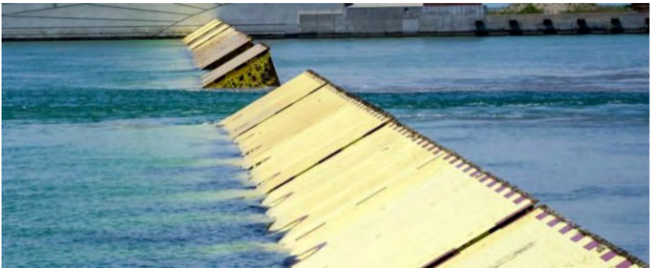
6. Mobile dams (note the defective and not working dam)