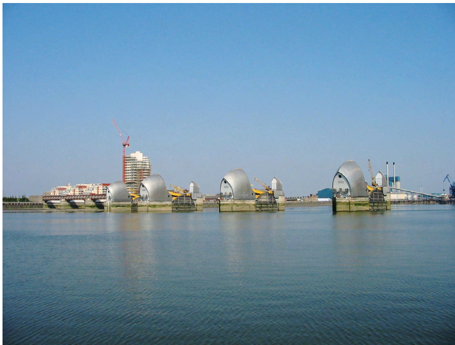
7. Surge barrier on the river Thames at Woolwich Reach (South of London). The barrier has been operational since 1984