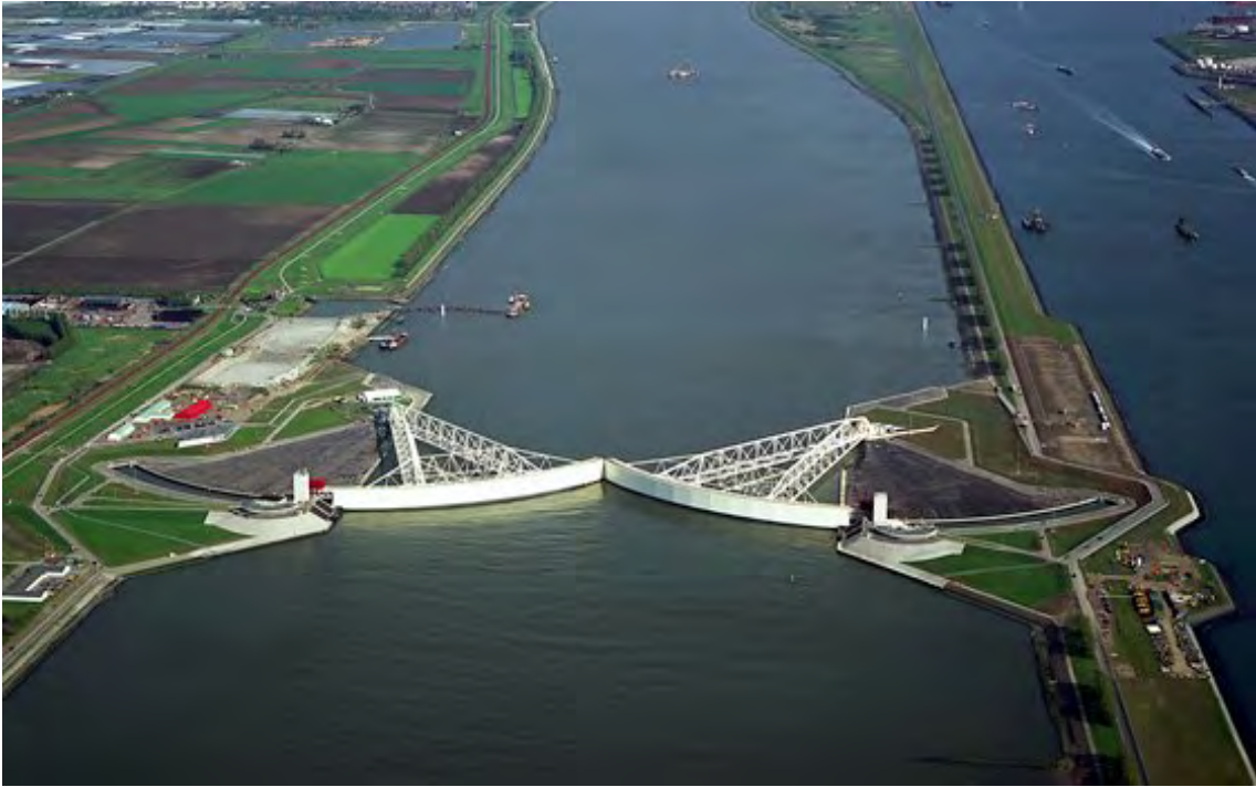
8. The surge barrier of Maeslantkering on the confluence of the rivers Oude Maas and Nieuwe Maas, Netherlands (opened on May 10 th , 1997, after six years of construction)