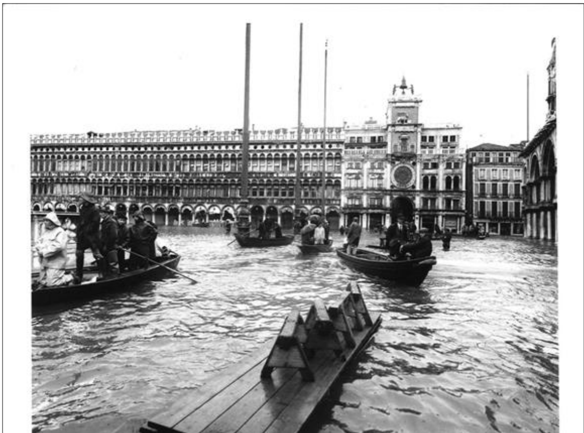
4. L'Acqua Granda , the extraordinary high tide on Novembre 4 th 1966