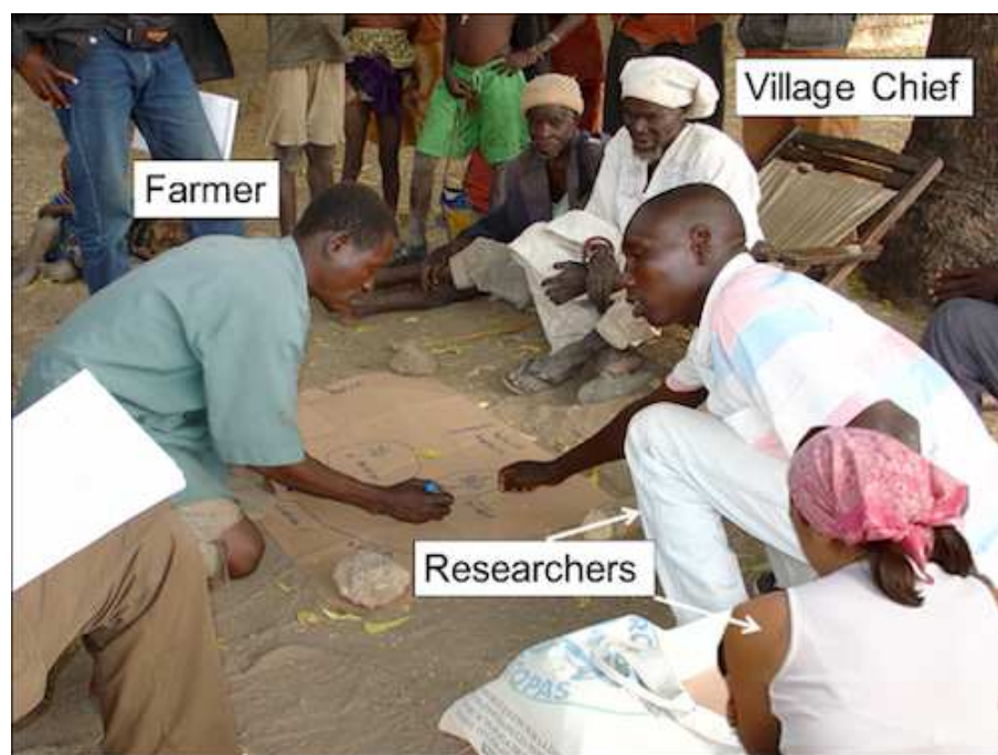
Figure 1 – Interpreters involved in community sketching at the village of Monko, Benin.

With regard to that which concerns the cartographic interpreter, we are confronted by two figures: the applicant, often a researcher, who, following his/her inquiry and observation, presents a problem to the community, and the cartographer, identifiable in a group of people from an association or village group (local authorities, farmers, growers, fishermen, hunters, women, etc.) (see Figure 1) 17 .