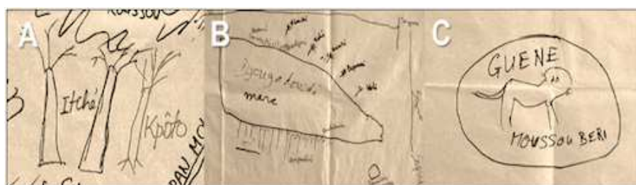
Figure 2 – Examples of icons which refer to symbolic, functional and jurisdictional knowledge (F. Burini, 2010).

In this way semantics are produced which favour a perspective view and the use of symbols which are mainly figurative, and to which the toponyms transcribed in the local language are associated. These are icons that refer to knowledge which is symbolic, which give to the land socially recognisable values such as history and myth (sacred sites, places of foundation) or performative and carry a wealth of knowledge that can be divided into three categories: functional knowledge, aimed at intellectual knowledge and material practices for the identification of locations in which productive activities take place (agricultural and pastoral areas, hunting and fishing grounds and areas which are harvested); jurisdictional knowledge which give information regarding the social and territorial organisation of the local community (village boundaries, position of land, political and religious authorities); and security knowledge, aimed at optimising the use of resources and at guaranteeing their reproducibility (rested agricultural areas, unused forests) 18 .