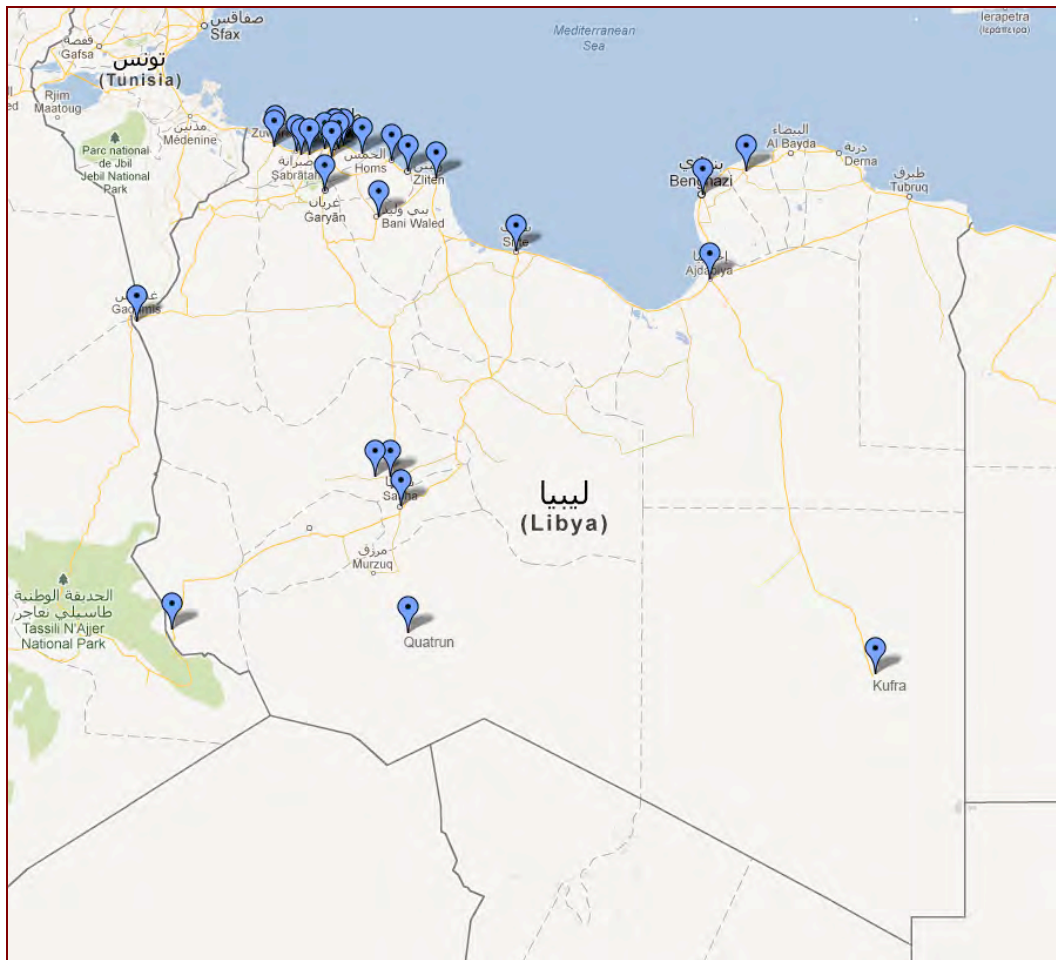
Figure 3: Migrants detention centres in Libya, 2007.

Yet, by comparing the messages in Gaddafi's billboards with the map of migrants detention centres in Libya, that can be accessed from the Fortress Europe website, 5 what clearly emerges is the paradoxical nature of Gaddafi's political project, deriving from the fact that Gaddafi's identity discourse was characterized by important gaps between what he used to say and what actually did on the ground. In fact, at Quatrun (close to Murzuq), at Kufra, and in the other major Libyan oases (Ghadames, Ghat, Sebha,...) government-run migrants detention centres have been built since the beginning of the 21 st century, transforming Libyan oases in the Sahara from an "open frontier" into "gated border sites."