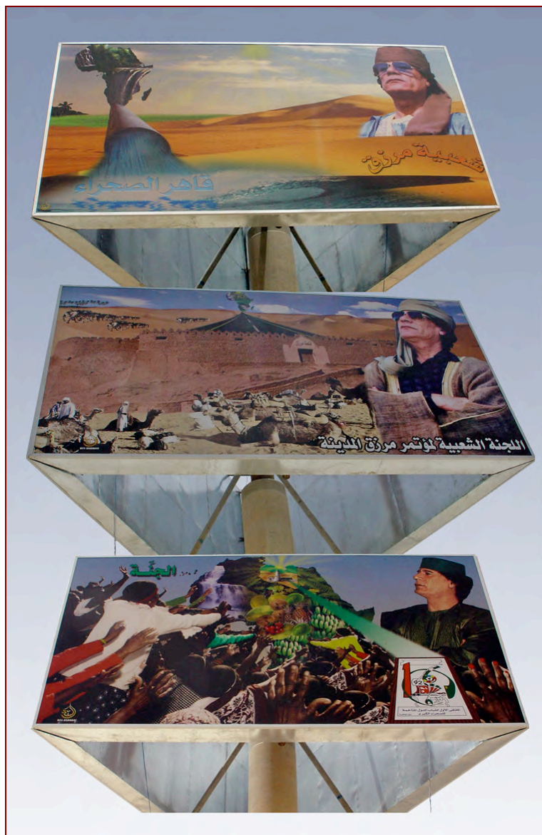
Figure 2: Gaddafi's billboards in Murzuq, 2004.

the Gaddafi regime (Bessis, 1986, 184-89). Taking this perspective, not only is Libya's significant black population – that can be noticed in the oases – connected with the ancient history of black Africans' slavery in Libya, but it also reveals a particular social reconfiguration that occurred within the Gaddafi's political project (mainly in the 1990s) bringing a significant number of black people to Libya to work principally in the gardens in the southern oases, in construction sites, and in garages. Black migrants were described, at the same time, as an important component of the Libya's oases identity, which Gaddafi took as mainstay of the Libyan national identity.