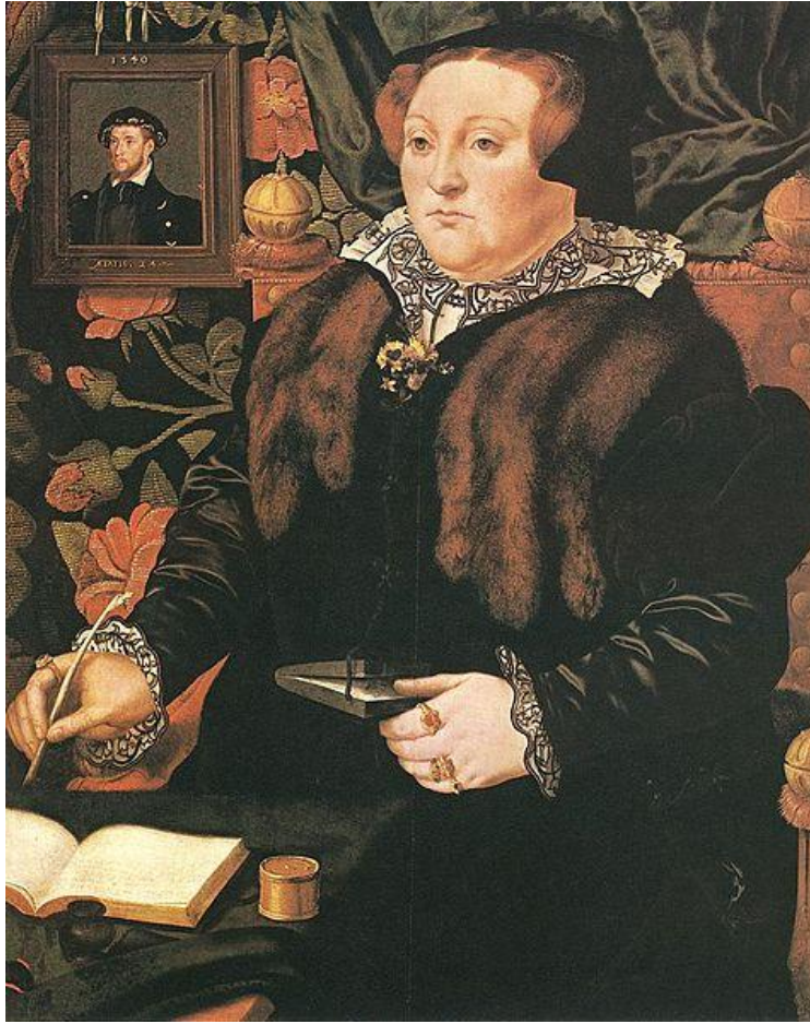
Illustration no. 4

Whereas widow portraiture is a recognised genre in art history, its counterpart, that is, pictures commissioned by widows of their deceased husbands, has only recently received critical attention. We do not know if and how women who remarried kept the portraits of their deceased spouses in early modern England and continental Europe. We possess very scant information. For example, we know of one case in the Netherlands: