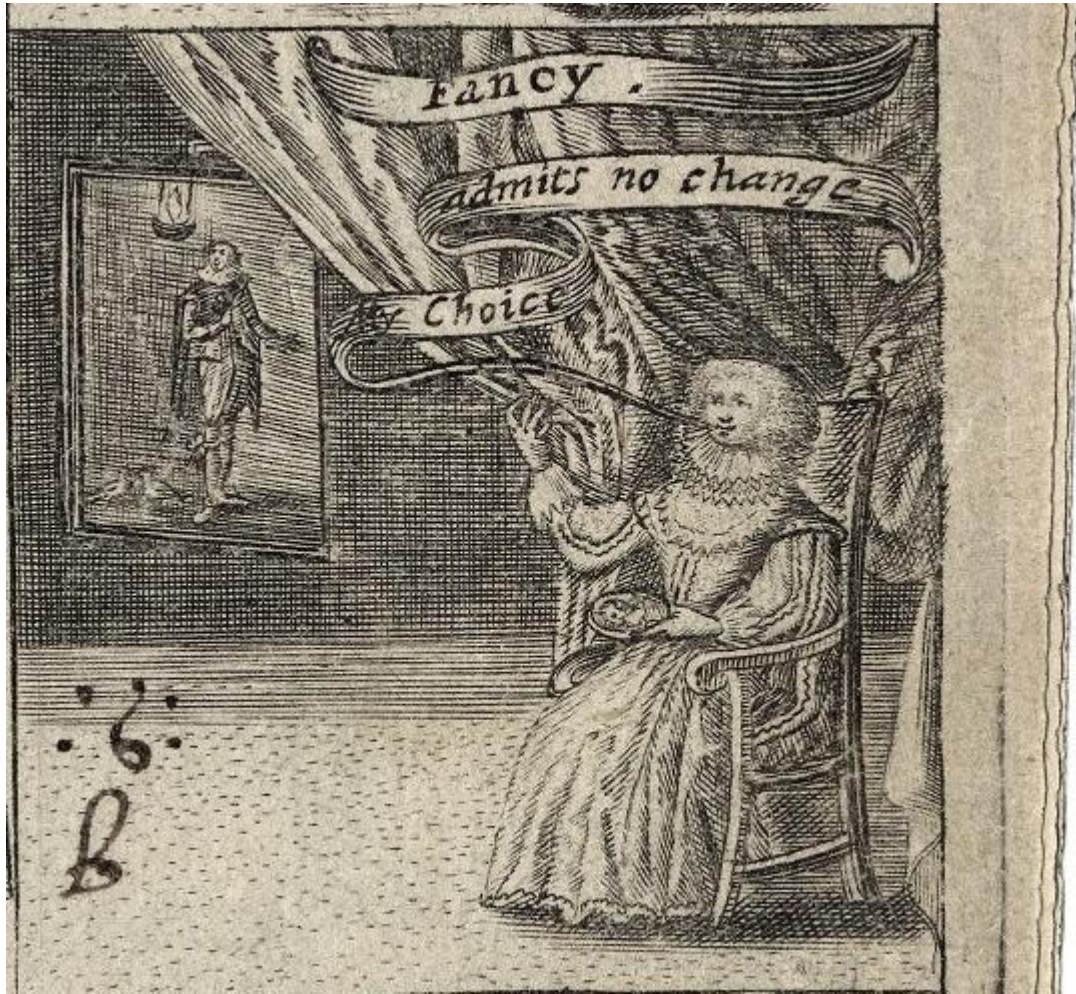
Illustration no. 3

I would like to begin my discussion of early modern widows' relation to the portraits of their husbands with an illustration (see no. 3) from Richard Brathwaite's The Complete Gentlewoman (London, 1631). In a lateral box of the frontispiece, we can see the picture of how a virtuous wife should behave in her judgement of her husband. The woman is seated and holds a miniature in one of her hands, while she draws the curtain to unveil a full-length portrait with the other. As one can read in a speech scroll, she is saying that "Fancy admits no change of Choice". This didactic illustration has been interpreted as follows: it "attempts to make clear that choice and opportunity, especially concerning another man, whether he be a second husband or a