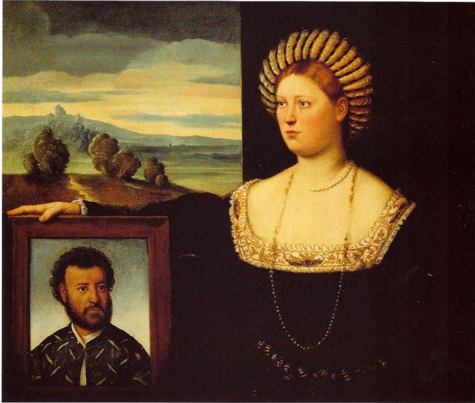
Illustration no. 6

However conventional in her attitude, Isabella's behaviour finds a startling correspondence with a passionate sonnet by an Italian woman poet, Francesca Turina Bufalini, Countess of Stupinigi, On Her Lord Husband's Portrait (1628):