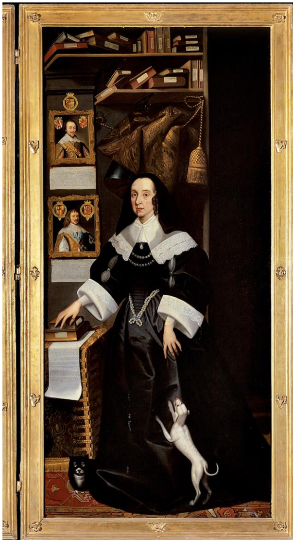
Illustration no. 5

Much later, in 1646, Lady Anne Clifford also commissioned a magnificent triptych (see Illustration no. 5) which shows her closet littered with blazons and small pictures of her family members, her two husbands (in the third panel on the right, “almost as trophies of her past” 61 ), and of herself at different ages.