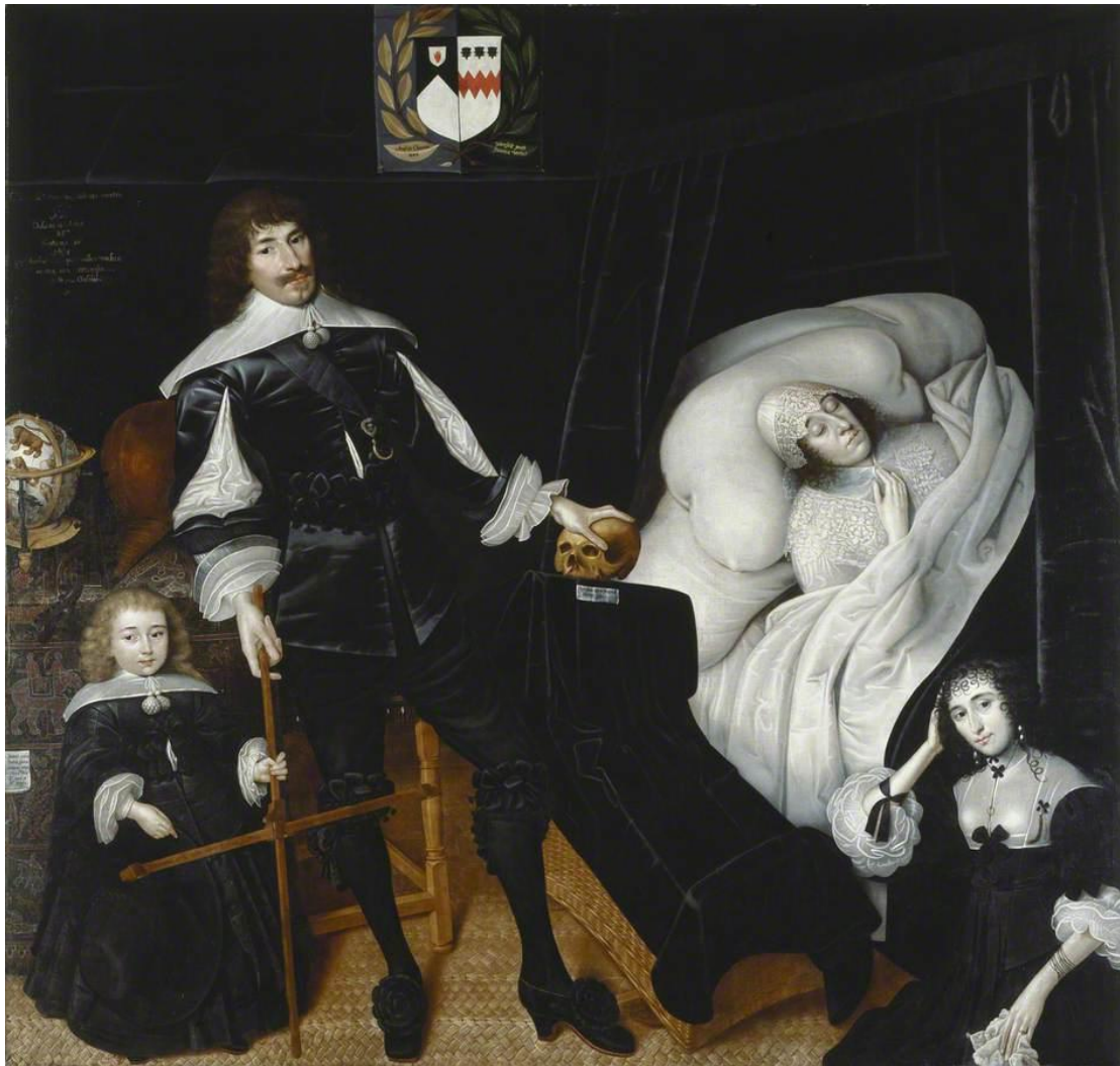
Illustration no. 7

can be easily disputed, since Sir Aston married Anne only in 1639. However, this picture can be regarded as a typical specimen of regional painting. It represents “local [...] portraiture at a more advanced stage of assimilation of the formal polite mode and with the techniques required by that mode” 14 , but it preserves all the essential features of English regional portraits: flatness, the presence of heraldry marking the importance of genealogy, symbolic props (a cross-staff, a skull, a celestial globe, a lute), as well as the use of symbolic perspective.