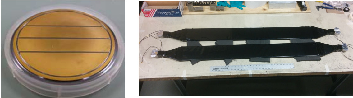
Figure 3: Left: a prototype 4-inch diameter Si(Li) detector with the required geometry for GAPS. Right: A prototype 1.2m long TOF scintillation counter that uses PMTs and light guides.