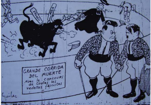
Le Canard Enchaîné, 29/07/1936, p. 2.

Figure 3 Stereotypes of intolerant and repressive Catholicism