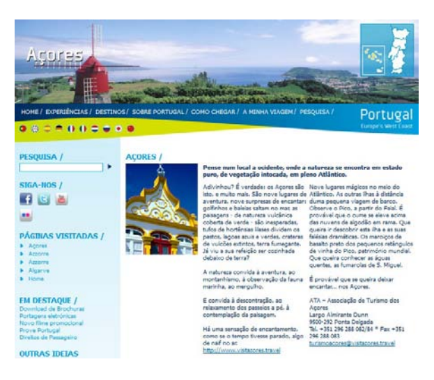
Figure 8 Web page of the Azores holiday destination

In the Italian version of the website, some of the destination names are left in Portuguese (e.g. Porto e Norte, and Lisboa), while for Madeira the English term 'Madeira Islands' is used. As mentioned above, the proposed destinations correspond to the seven Regional Agencies for Tourism Promotion and each of them has its own website.<sup>8</sup> By clicking on Per saperne di più ('For further info'), web visitors are directed to the destination web page which is constituted of a small picture and a long description. At the end of the description, both the link to the regional agency and the address of the tourist office are available.