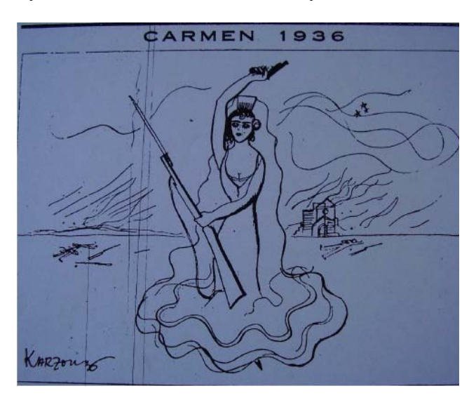
Figure 1 Carmen, a Spain's Romantic image

on celluloid, reproducing the same stereotypes of archaic masculinity and a tragic, infantile femininity that needed to be restrained by others.