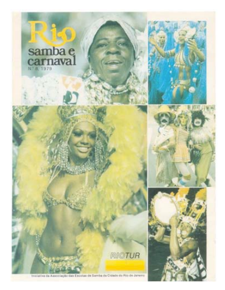
Figure 3 Covers of the Rio, Samba e Carnaval magazine

It must be noted that a tourist image based on a commercial use of the female body recalled the negative and discriminating stereotype of the sensuous and intriguing mulata so typical of the colonial slave period. Suffice to say that, in 1711 the Jesuit father Andreoni (full name André João Antonil), in his work titled " Cultura e Opulência no Brasil por suas Drogas e Minas " (book 1, chapter 10), described Brazil as the paradise of mulatos and mulatas , the purgatory of the white and the hell of the black (Cfr. Antonil, 1982) and added that mulatas used their sensuousness as a means of social climbing – the latter being an element which frequently appears in the literature. Antonil was not the first one to underline this feature, nor will be the last to defend the myth of the mulata 's tropical sensuality.