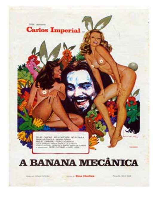
Figure 4 Poster of a film belonging to the Pornochanchada genre

As the images in these pages testify, communication had never been so explicit in Brazilian tourist discourse. In their graphics, these images resemble the pictures that EMBRAFILME – a national board for film production, in other words, the filmic counterpart of Embratur – used in the late '60s to advertise a series of highly-popular erotic films (the so-called Pornochanchada , Figure 4) which aimed to distract the public from politically-involved films ( Cinema Novo and Cinema Marginal ) by offering a more attractive alternative based on the display of the female body.