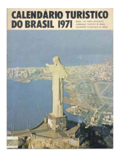
Figure 1 Calendário Turístico do Brasil, 1971, published by Embratur

Consequently, the tourism policy of Brazil can only be analysed considering the socio-political context within which such policy developed. Only in this way, we will we be able to understand the rationale for tourism communication proposed by Embratur which aimed at portraying Brazil as an earthly paradise characterised by love and harmony in a Catholic and multiethnic context where peace was guaranteed by a constant fight against communism (Figure 1).