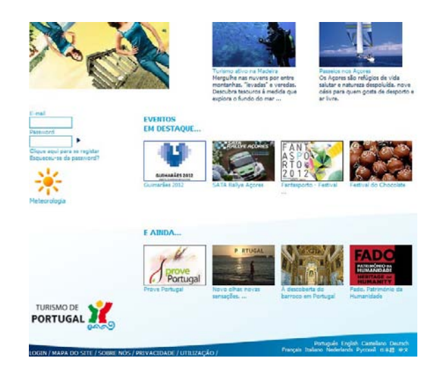
Figure 3 The home page, 'below the fold'

Here, there are links and images that direct you to events in the foreground and other sections of the site (also accessible from the menu). On the fold of the screen there are three images cut in half with links that direct users to other sections of the site. In order to increase the usability of the site it would be advisable not to cut the information 'above the fold', moving in the foreground the events in this part (which otherwise might not be displayed).