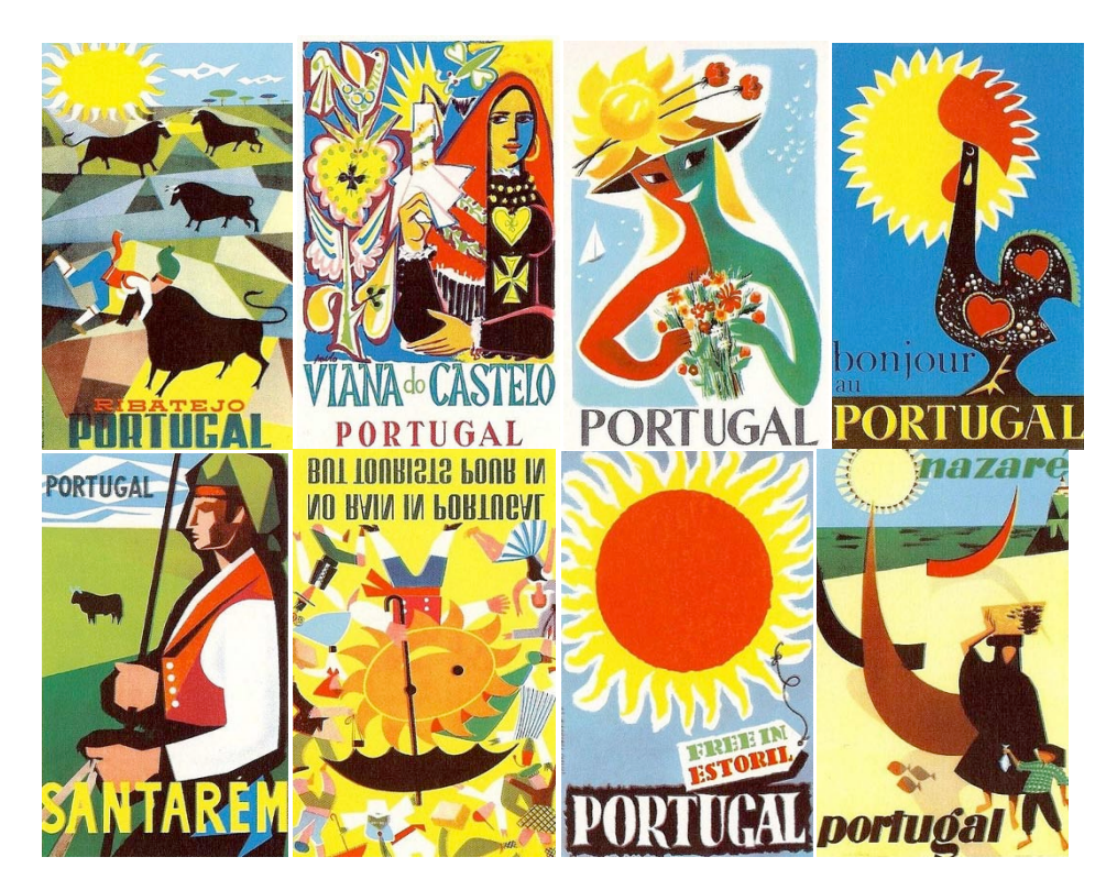
Figure 1 Posters published in the magazine "Panorama" and created for the SNI

With the Expo98 event, the Lisbon Treaty and the 2004 European Football championship, Portugal began to attract the attention of the media. This contributed to the development of tourism promotion through modern and powerful means of communication, such as the Internet. The creation and constant updating of the official web portal and its satellite regional websites marked the beginning of a new promotional era which is now moving towards the use of social networks. Indeed, many Portuguese towns have updated their marketing strategies, taking advantage of social networks, in particular Twitter and Facebook.