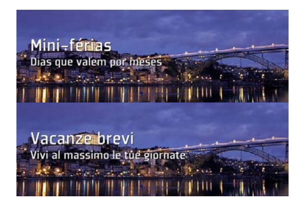
Figure 7 The Short-breaks image

Short breaks are a type of tourist offer that primarily target workers who have few days available for a trip, and, for this reason, they prefer weekends and bank holidays. The tourist slogan should, therefore focus on the intensity of the holiday in order to convince the prospective customers to opt for it. In the image reported above, against a view of the city of Porto both versions make use of similar concepts (Figure 7; Table 4).