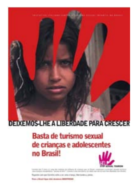
Figure 5 Advertising campaign against sex tourism in Brazil

Nevertheless, changes have been recently seen in the composition of incoming tourists fluxes: although the majority of tourists are still male Americans and Europeans (mostly Italians and Germans), a gradual increase can be noticed in the number of families and groups of women that travel to Brazil every year.