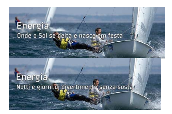
Figure 5 The Energy image

In the Energy section the images are the same in the Italian and Portuguese versions, but they are matched with a different slogan (Figure 5; Table 2).