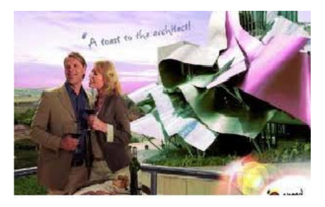
Figure 9 Commercialization of Spanish tourist goods and services

To develop Spain's image as a tourist destination, going beyond the almost exclusive association with sun and beaches and adding new assets linked to other reasons for going on holiday.