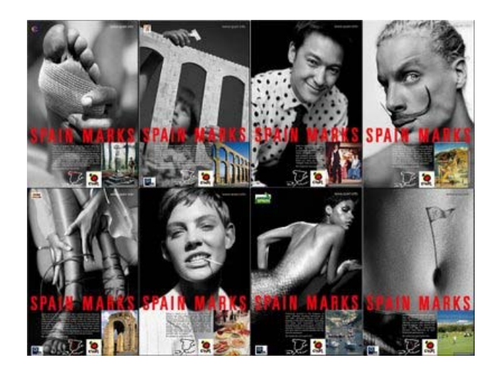
Figure 8 Distinctive aspects of a holiday in Spain

To develop for the brand a communication strategy designed to highlight the distinctive aspects of a holiday in Spain in comparison to other rival destinations, emphasising in particular: 1) the Spanish lifestyle, 2) the European context, which entails quality and cultural proximity, 3) personalisation of the experience, 4) the rich variety on offer (Figure 8).