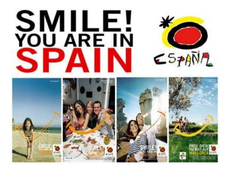
Figure 6 The Spanish way of life

All of this is expressed in the descriptive marketing of brand Spain and its slogans, listed here in chronological order: