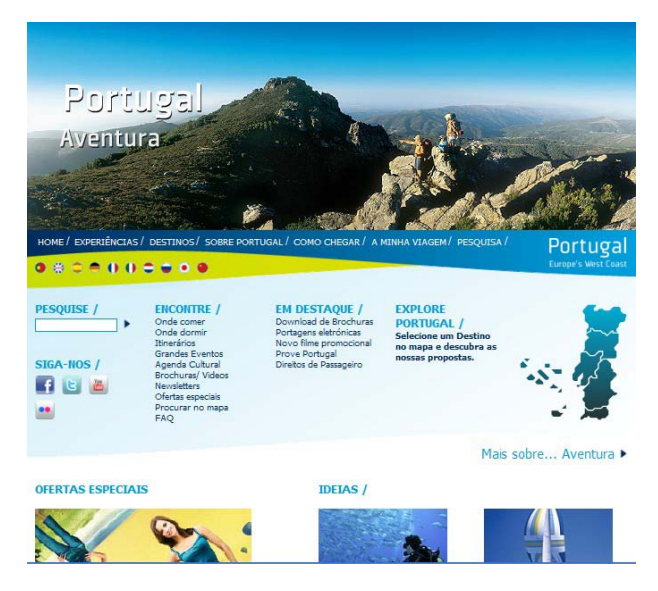
Figure 2 The home page, 'above the fold'

The information at the bottom of the web page, or 'below the fold', will be probably viewed only by some of the users (Figure 3).