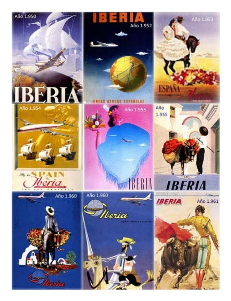
Figure 4 Country's collective image by Spain's flag-carrier Iberia

The aim was to attract tourists in order to obtain hard currency for a poor society. Iberia, as will become clear, made extensive use of the stereotype of an exotic country, including folklore, castanets, bulls, etc.