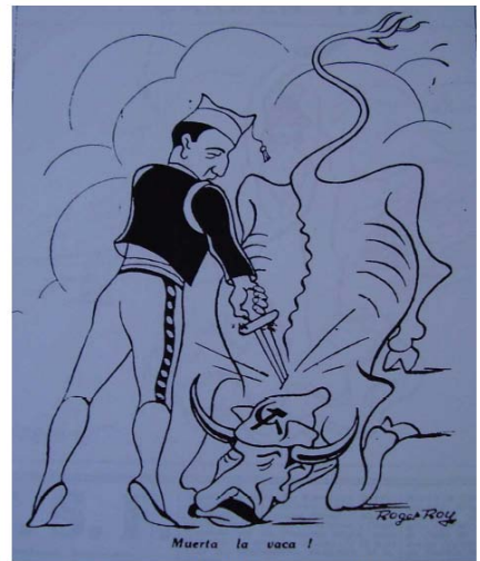
Gringoire, 13/11/1936, p. 12.