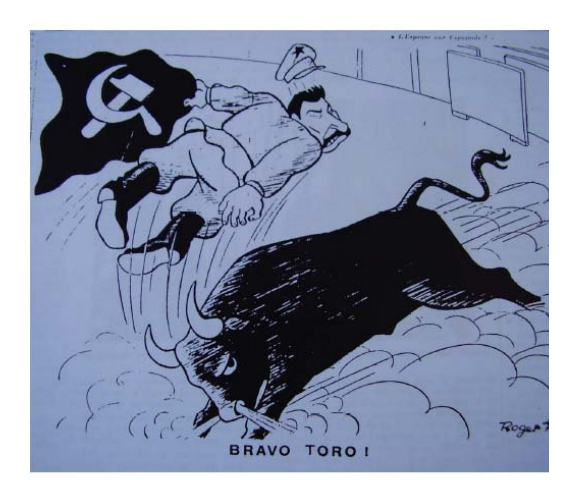
Gringoire, 21/08/1926, p.1.

Propagandists for both sides sought to convince world public opinion of the legitimacy of their respective causes. Each side sought help from abroad and their publicity materials were oriented to this goal. While the Nationalists played on the theme of Catholic resistance to the French revolution (Figure 2) and raised the spectre of Bolshevism, the Republicans deployed the romantic stereotype of the free people in arms and sought to associate their adversaries with the Leyenda Negra reproducing stereotypes of intolerant and repressive Catholicism (Figure 3).