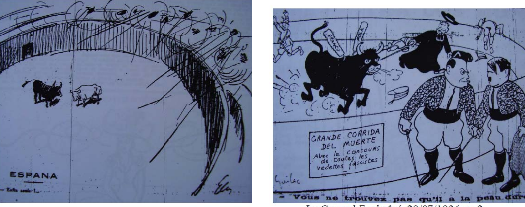
Le Petit Parisien 29/07/1936, p. 1.