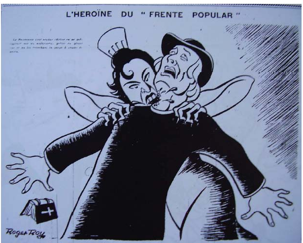
Gringoire, 25/09/1936, p. 3.

Contrary to what might be imagined, the civil war did not entail any change in this situation. Whereas the Spanish Republic had been characterised by continuous crisis, confirming the myth of Spain's political abnormality, from 1936 onwards it constituted a neo-romantic space in which the battle of good and evil was played out, a matriarchal, utopian land and the theatre of extreme political violence.