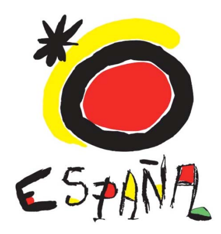
Figure 5 Spanish tourist brand designed by Mirò

Under his leadership, Spain's first tourist marketing plan was drawn up. One of the objectives was a clean break with the past: the establishment of a new image – different, cultivated and universal – that would do away with the old stereotypes and go beyond the idea that 'Spain is different'. The focus was on Spanish identity, emphasising the name of the country with its distinctive letter \tilde{N} , which therefore needed to be highlighted.