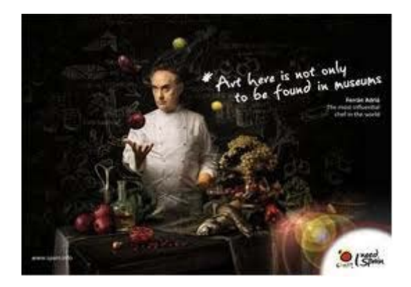
Figure 7 Emotional branding

To maintain and strengthen the 'brand Spain' image campaigns in order to increase its recognition and improve its position in the international tourist market (Figure 7).