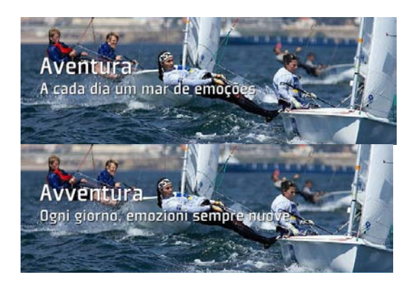
Figure 4 The Adventure image

Let us start from the Adventure section (Figure 4; Table 1).