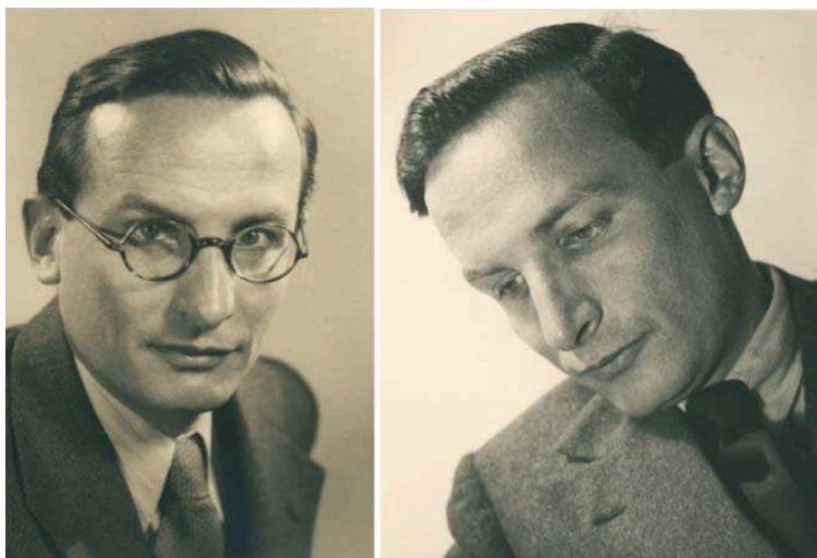
Figure 4. Rudolf Arnheim during his Italian years

Beyond the humorous dimension of this enjoyable article, its sarcastic – even sardonic – tone shows a certain resistance to innovations and implies a critique of “talkies” (that is, to the introduction of speech), censorship, star-mania, and formalistic style. At the same time, the article extols the “wonders” of technique and implies a challenge to it: technology must be used to achieve a more artistic result, rather than mechanically reproduce reality.