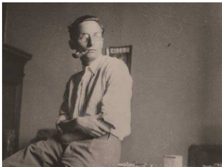
Figure 2. Rudolf Arnheim in the Cinema editorial office (Rome, 1938)

Nostromo 15 , the author of the correspondence with the readers, in a column called “Capo di Buona Speranza”, which was first erroneously attributed to Francesco Pasinetti 16 .