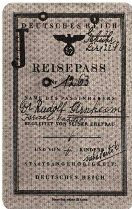
Figure 6. Front page of Rudolf Arnheim's passport during his Italian years

The nightmare was turning into reality, and this final diary entry sounds like a premonition: the climate in Italy was becoming darker, as political events turned for the worse. On January 3, 1939, he went to the German embassy in Rome to extend his passport. That day, a disturbing “J” was printed in red on the front page of the document, an indelible mark of his Jewish origins. In early 1939, still in Rome, Arnheim applied for assistance to the German Jewish Aid Committee 34 . On 25 April, he obtained a visa for the United Kingdom, and on May 3, 1939, he requested a free transit-visa to the Consulate of France in Rome in order to embark for England. Within a few days, he left Italy.