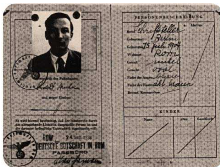
Figure 5. Rudolf Arnheim's passport during his Italian years

the country. If one places the last pages of his Italian diary and those of his passport side by side, an incredible story emerges: we gain an understanding not only of the impact of history on his private concerns and anxieties in those months but also a private and personal perspective on some momentous events in world history 31 .