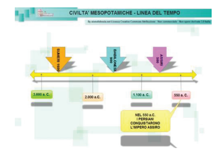
Fig. 3. Interactive timeline in the group lesson