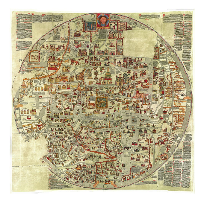
Fig.1 The Hereford Mappamundi (1300 ca.), centred on Jerusalem.

Jerusalem is at the centre and—among other symbolic elements—there is a pervasive horror vacui , standing on the religious way of intending the world reality in its complexity (Fig. 1).