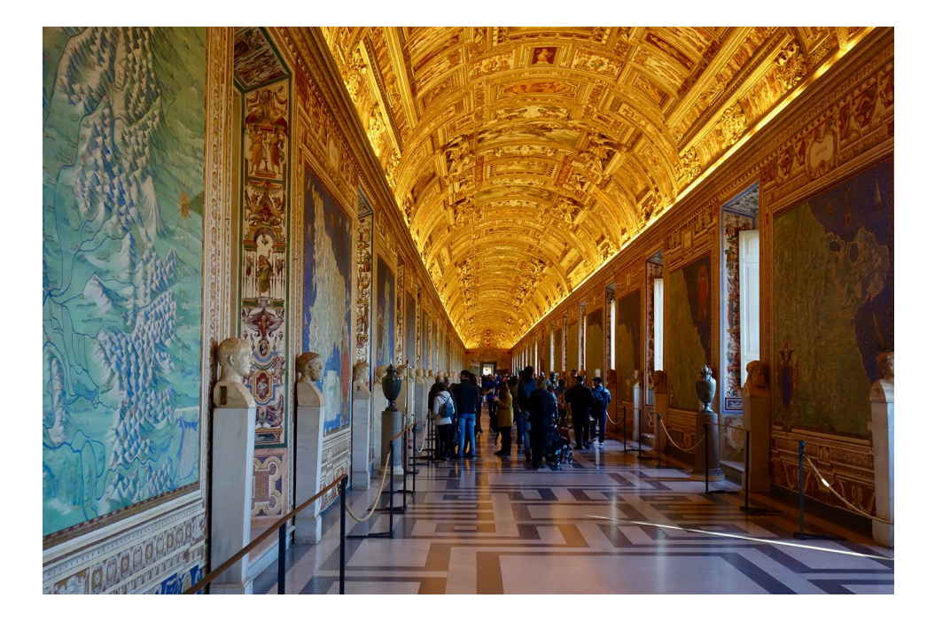
Fig. 4 The "Galleria delle Carte Geografiche" in Vatican as expression of power, Catholic doctrine and a sum of maps and art.

essential elements which involved all the European world, not excluding the Catholic contexts.