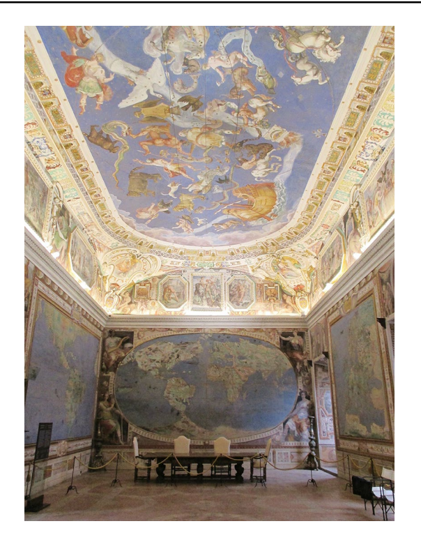
Fig. 3 The "Sala della Cosmografia" in Palazzo Farnese in Caprarola, sum of the Counter-Reformation art and Cartography.

Lutheran doctrine, which contributed to uncertainty with their centrifugal pushes.