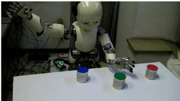
Figure 2. The set up of iCub for experiments is described in Section 2.1. The robot was trained via a trial-and-error process to respond to sentences such as "reach the green object". It then becomes able to generalize new, previously unheard sentences with new behaviours.

The MTRNN and RNN methods above were applied in experiments with the iCub robot to investigate whether the robot could develop comprehension skills analogous to those developed by children during the very early phase of their language development. More specifically, we trained the robot using a trial and error process to concurrently develop and display a set of behavioural skills, as well as an ability to associate phrases such as "reach the green object" or "move the blue object" to the corresponding actions (see Figure 2). A caretaker provided positive or negative feedback about whether the robot achieved the intended results.