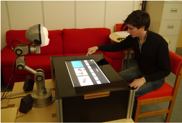
Figure 4. Setup for social learning of word-meaning pairs by a humanoid robot. See section 3.2.

Outlook: These experiments showed how the design of the learning algorithm and the social behaviour of the robot can be leveraged to enhance the learning performance of embodied robots when interacting with people. Further work is demonstrating how additional social cues can result in tutors offering better quality teaching to artificial agents, leading to improved learning performance. These experiments have been incorporated into an ERA architecture, as described in section 2.2