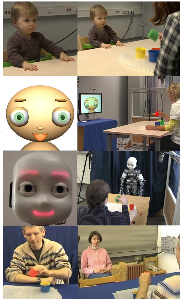
Figure 5. Experiments to gather interaction data. Participants (parents, adults) were asked to demonstrate actions such as stacking cups to a child (top level panels), a virtual robot on a screen (2nd level panels), the iCub robot (3rd level panels) or another adult (bottom panels). See section 4.2

The reports in this section focus on analysing social interactions, particularly between a teacher and a learner. The results from these experiments feed into work on robotic language learning, as described in sections 2 and 3, where iCub learns from a human teacher (on the other hand, a human may learn an action from a robotic demonstrator). The first subsection describes research into communication, possibly not intentional, through gaze,