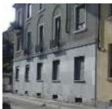
Figure 1 - Magistretti's house

my traveller's life brought back and projected unto the present situation: I've travelled the world but this year I know I will travel nowhere. I remembered that was indeed the title of the "Magistretti Voyages Projects", an exhibition whose recollection was setting off strange short-circuits in my mind. Why just that exhibition among the many? I remember quite well that it was especially an enquiry on the gaze in urban environment, a report of visual adventures with a camera at hand: "a sidewalk candid photos show" 51 . And as a tourist, quite instinctively, with my I-phone at hand, I started taking some photos of the surroundings: of Magistretti's sober house (Fig. 1) and, again my back on those walls, of the remarkable sites in front, the Conservatorio Verdi and the Chiesa della Passione (Fig. 2, 3). Images with a strong historical density, made denser under the emotional stress of the actual moment.