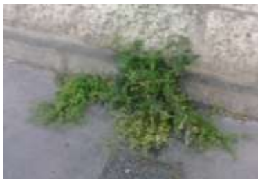
Figure 9 - Green in the pavement’s holes