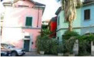
Figure 13 – A block of small and coloured houses