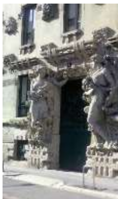
Figure 6 – Two stony nymphs at Casa Campanini's entrance

What was guiding my gaze was certainly a Stendhal syndrome: I was not casually picking up details surfing across spaces, as these new sensations were immediately prolonged in a historical dimension, every sign or piece of stone was there in its full density. But I was also experiencing the 'aside' look that Benjamin associates with the dynamism of making sense of images: when images live in a kind of "Standstill" (what was acknowledged, in the collective memory, is abruptly suspended in a no-time lapse and thrust back onto the beholder augmented by the subjective momentary perception) (Benjamin, 2002), an increment which flares them up beyond their well-known function and beyond their received sense.