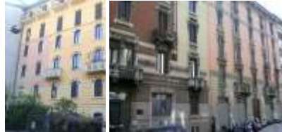
Figure 14 - The continuity of the style of the buildings

That area was at the back of the famous Milano Teresina (after the Austrian Empress) located along Corso Venezia - the 19 th century of the Austrian domination over Milan that so indeleibly marked the architecture of some city areas. The Milan West End and East End: the East End being the mews, the popular and small bourgeois quarters in face of the luxurious residences of the rich-servants, small shop keepers and artisans in support of the domestic and elegant life of the then dominant classes.