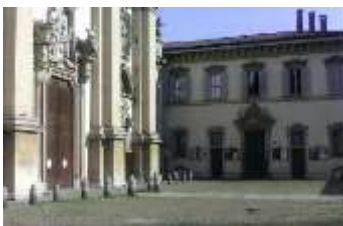
Figure 2 - Conservatorio Verdi