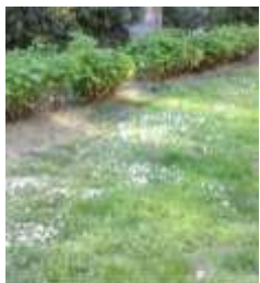
Figure 8 - Daisies on the grass

suffocated by pollution and inhabited by “hollow men”, but exposed to the almost painful signs of spring-life blooming against the shallow life of its citizens. Also in that empty and dead Milan nature was speaking, spring was blooming, and the green literally exploded in my eyes just as I turned round the Eastbound corner, opposite the more famous West area that I had explored in my previous peregrinations. My East End - my favourite quarter for food shopping - welcomed me with a small patch of grass pointed with numberless daisies (Fig. 8), an incongruent view in the stone jungle of a densely built area. In the surreal silence of the drowsy city, somehow seduced by the green vein lurking here and there, springing from the pavement’s holes or hanging from street sills (Fig. 9, 10), I found myself in front of a small village of tiny houses, cosy two-storey houses adorned with tiny gardens full of those flowers typical of countryside orchards.