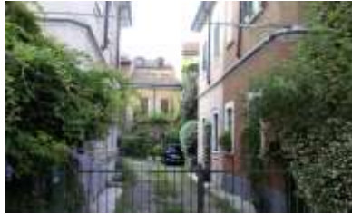
Figure 12 - 19th century conglomerates

The air was bright and scented, people stayed in their locus amoenus enjoying their tiny sunny gardens, lying on a chaise long, reading or eating, as if they were on vacation - I must admit that I envied them, and that staged privacy so unusual in big towns. It was like being in a movie, or better, as if they were in a movie or and me watching them from behind a screen - an unreal scene in an unreal city. At the very end of the street - outside that oasis - another block of small, coloured and stylish houses awaited me, once again an unexpected view (Fig. 13). I couldn't really tell the age of those original forms - it might be in between the two World Wars, or even before, refurbished houses of the end of 19 th century. Once at home I would do some historical investigation for sure, but meanwhile I was enjoying that strangeness, and started tracing then a colour vein of yellow and pink that suddenly appeared spread out by and by, once reached the large streets Eastbound that encircled the small village. That was actually the right sign to detect around: the evidence of a continuity, of age and style, was more evident to me, an illumination (Fig. 14).