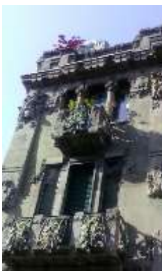
Figure 5 – Casa Campanini