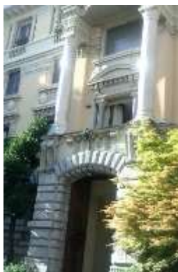
Figure 4 – An elegant neo-classic house

steps, with in mind an Art nouveau vein that was actually visible scattered here and there: balconies, statues, friezes, decorations, iron grates had become so evident as to guide me by and by through connections and correspondences. The whole quarter resounded Art nouveau in its different international variations.