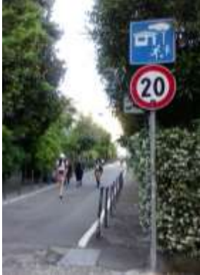
Figure 11 - A narrow lane crossing the small village