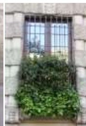
Figure 10 - Green hanging from street sills

I had a vague memory of that place as I entered a narrow lane that crossed along the small village (Fig. 11). A strange Milan was there - pale blots of azure, green, yellow and pink elegantly jotted in a landscape of grey, cream and brown blocks - as if a pastel colour line memory of certain Hapsburg popular dwellings had broken into the massive 19 th century conglomerates that were there dominant (Fig. 12).