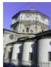
Figure 3 - Chiesa della Passione

Returning home, a few steps back, I realized that on my way I was looking at places differently, the eyes pointing at a couple of remarkable sites always been there, but hardly noticed before: an elegant neo-classic house embraced by a green mass (Fig. 4) and Casa Campanini, a massive Liberty building with two giant stony nymphs at the main entrance, festooned with garlands of leaves (Fig. 5, 6). I could then fancy a proper tourist itinerary within a few